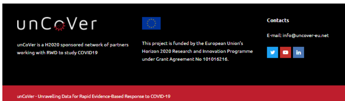
Figure 4 - Website footer

Other sections of the website include the footer (Figure 4), where users can find the dedicated email address to contact the network, the European Commission (EC) logo and acknowledgment with a hyperlink and the addresses/handles for the network’s social media