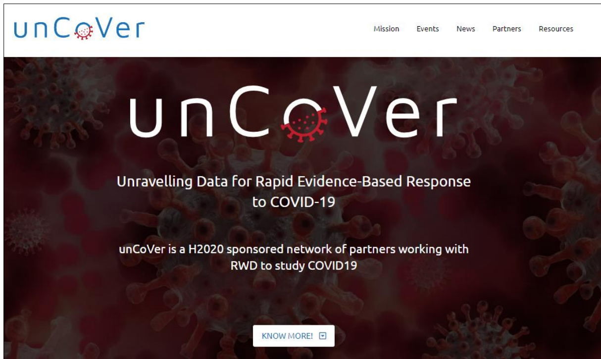
Figure 1 - Homepage of the unCoVer website

Mission: This section presents the specific aims that are to be achieved by unCoVer. It will also include the composition of all committees and substructures in the unCoVer project.